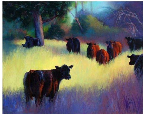
Standing Guard, web.jpg