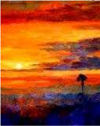
"Alone and Waiting"

His show is titled "The Colorful World of Gabriego."