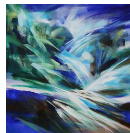
"Winter Says Goodbye" Acrylic, 24"x24"

Gallery hours are Tuesday through Saturday, 10:00 a.m. to 4:00 p.m.