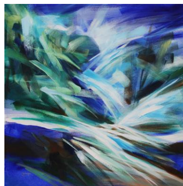
"Winter Says Goodbye" Acrylic, 24"x24"

"I have always been in search of a distinct identity in the use of the brush. Whether it be a landscape, a figure, or an abstract, it has always been such a struggle. But recently I used the flat of the brush to layer an almost transparent glaze of color upon another color, using diagonal, vertical, and horizontal strokes. In doing so, an image is formed in an almost impressionistic yet abstracted style, very challenging and yet surprisingly phenomenal. Patience and persistence on the artist's side takes over for the right color to come about and the suspense is even more so heightened in the decision of when to stop. This interplay of color layering gives me such joy and peace as I see myself working on the transformation and completion of each masterpiece. After what seemed to be a lifetime search for my true self, I have finally realized my life's passion. I am now blissfully happy and totally at peace with a brush in hand, a color palette by my side, and a blank canvas to work on."