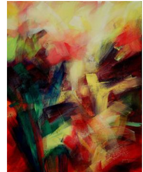
“Forbidden Path” Acrylic, 20”x16”

Gallery hours are Tuesday through Saturday, 10:00 a.m. to 4:00 p.m.