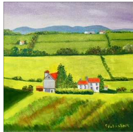
Below: Charlotte Potashnik / Oil