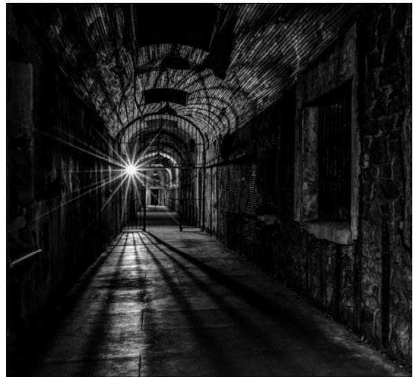
Second Place "Through the Light" by Lori Saunders