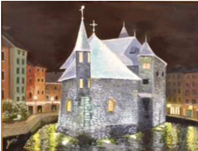
Watercolor by Viktoriya Maslova