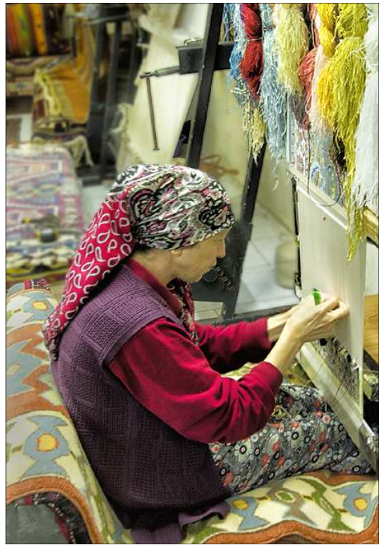
“The Carpet Weaver, Turkey”

513 Maple Avenue W. 703-319-3971 Tuesday - Saturday 10am-4pm