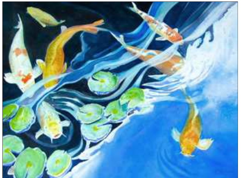
“Blue Sky Reflection” Watercolor by Ruth Ensley