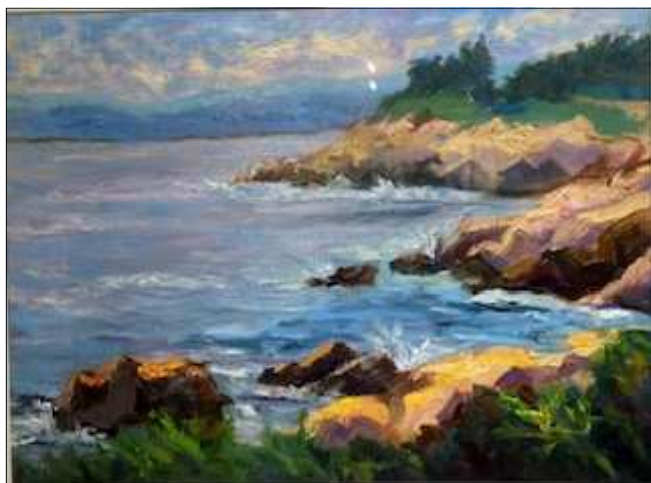
Oil by Leo Deege