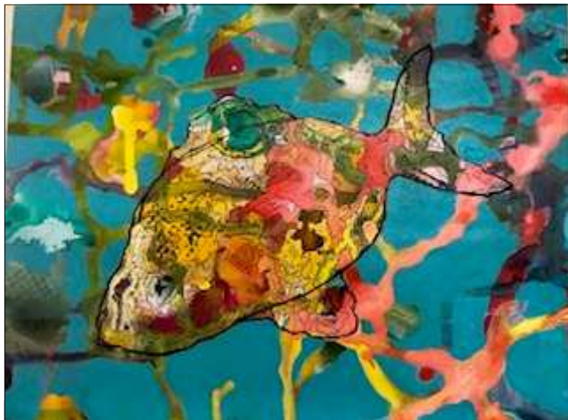
Acrylic & Ink by Alice Nodine