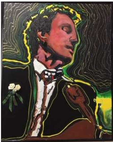
Top left: Batik by Doré Skidmore