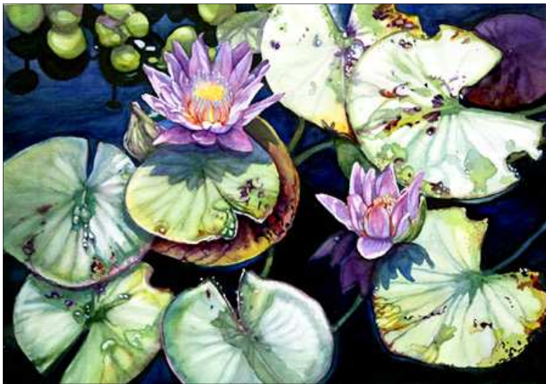
Honorable Mention: Ardythe Jolliff: Watercolor "Pot of Gold"

First Place: Madeleine Chen, Oil, "In the Park" (shown on front cover)