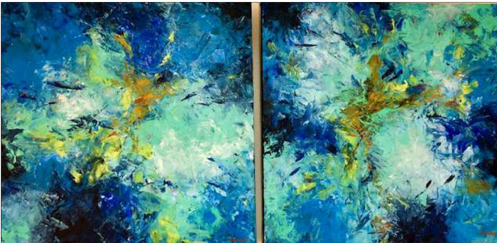
Top left: Ruth Ensley, watercolor