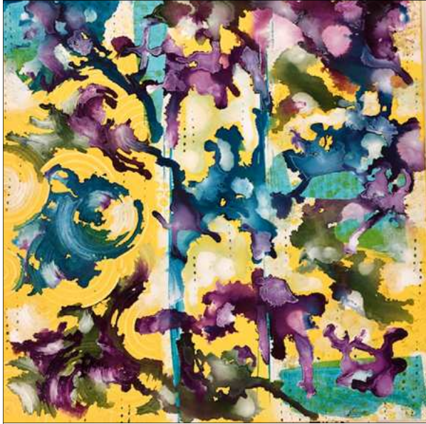
Alice Nodine, mixed media

Member Show “BURSTING OUT ALL OVER” continued at the Art Center