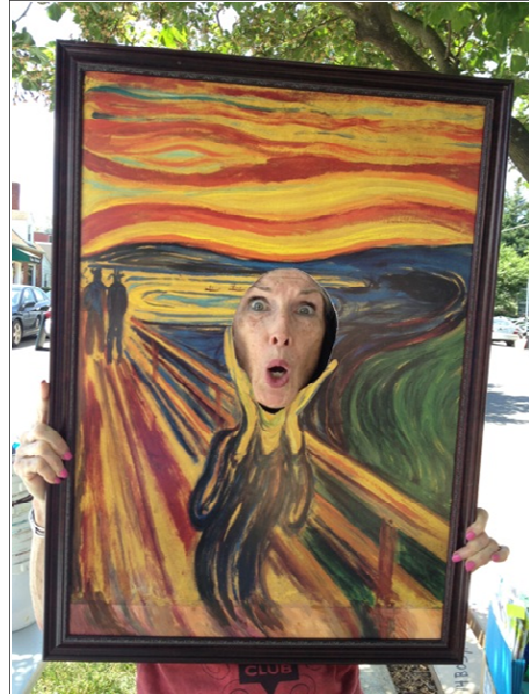
Everybody wanted to "Scream"